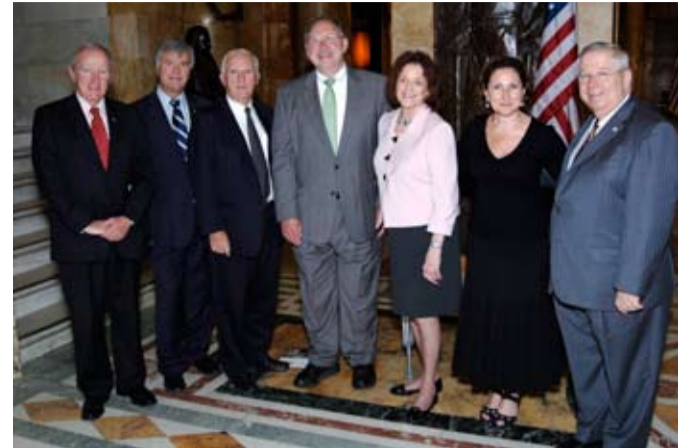
Key Massachusetts Legislators Support the PRIME Act

D ance for the Cure is a public awareness and fundraising campaign with a goal to end the prostate cancer crisis, which strikes as many as 1 in 6 men. Prostate cancer has become even more common than breast cancer, which strikes 1 in 8 women. No family and no community in the United States is left untouched by this epidemic. Yet, in spite of the magnitude of the prostate cancer epidemic, public awareness and research investment lag behind. Men do not have accurate diagnostic tools for early detection akin to mammography for breast which is critical for cure and saving lives. The impact is dire: A man dies every 19 minutes, even though prostate cancer is curable when detected early.