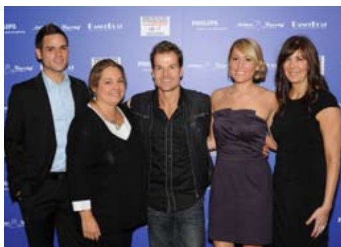
Louis van Amstel of DWTS (Center) with fans