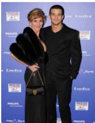
Shirley Ballas and Mark Ballas of DWTS